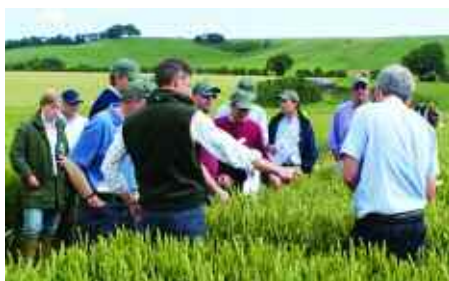
The new project is very farmer-focused and will give growers a clear picture on how to adapt strategies.

AHDB Information Sheets 48 and 49 have been updated with the latest fungicide activity and performance in wheat and barley. To download them, go to cereals.ahdb.org.uk/publications and search publications for IS48 (wheat) or IS49 (barley).