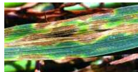
What researchers don't yet know is whether the resistant isolates carry a fitness penalty.

"But that's all with the benefit of hindsight. Growers started their 2015 fungicide ▶