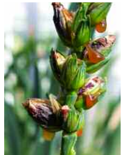
Ergots (black sclerotia) occupy the site of the infected grain within the ear and contain alkaloids which pose a risk to human and animal health if eaten.

Anna's one of very few pathologists working on ergot and has been studying the fungus for the past decade. During a BBSRC-funded project looking at the host ▶