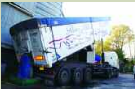
If the European Commission introduce a maximum limit for ergot alkaloids, it will be impossible to test loads on intake because there isn't a rapid test available.

“We’ve been working with our colleagues in Europe and it’s agreed that meeting the standard imposed by an alkaloid limit is practically unworkable for processors. Control of sclerotia will remain the simplest, most cost effective and timely way of protecting consumers.”