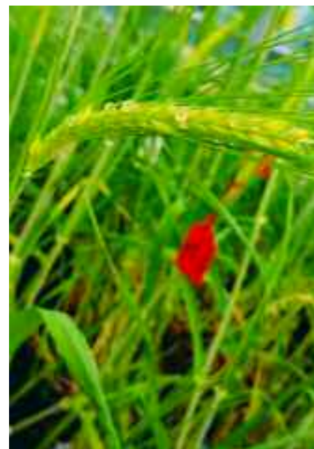
It's possible that alkaloids contained in honeydew may be responsible for contaminating adjacent healthy grains.

“The industry is in a similar position to when the DON and ZON mycotoxins first hit the headlines in 2006. The AHDB monitoring helps create a national picture and enables us to prepare for any future legislation,” he concludes. ■