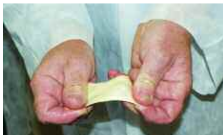
Researchers will be looking for the gluten fraction that delivers the desired visco-elastic properties.

for Cereal Science and Technology. Granted just once every four years, it was awarded for his outstanding research on wheat and other cereal grains, ranging from grain structure and functionality to molecular genetics. ■