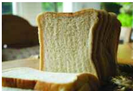
Researchers now know much more about the regions of the wheat genome responsible for baking quality.